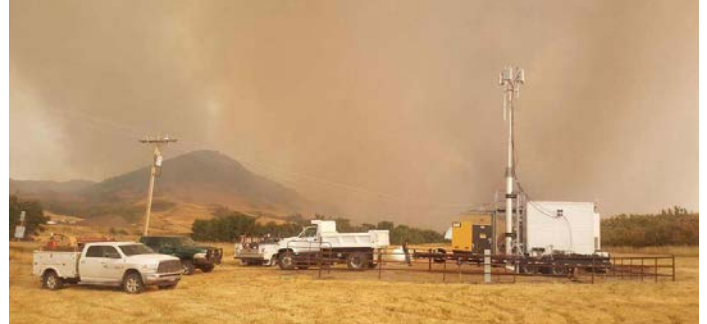
Triangle Mobile sets up a COW (cellular on wheels) to help with communications during the East Fork Fire in the Bears Paw Mountains.

Our sister cooperative, Triangle Communications and its subsidiary Triangle Mobile, provided three COWs (cellular on wheels) to ensure that the men and women working on fighting the fire could continue to communicate.