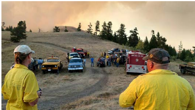
Fire crews, volunteers and HCE employees regroup their attack on the East Fork Fire in the Bears Paw Mountains.

First, I want to reach out and brag about our HCE team! The response to this event has been nothing less than spectacular and humbling. From the employees who volunteer for the local volunteer fire department, to the many employees who volunteered in several different ways, I applaud all you have done. HCE employees helped supply a water truck to ferry water between one site and closer to the fire. They also provided food and bottled water. They helped move cattle and assisted people out of their homes. Non-firefighter employees volunteered to go out and help neighbors and friends protect their property.