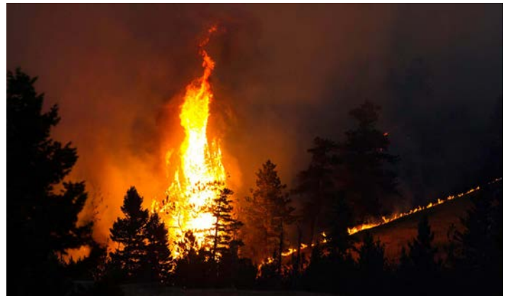
of an East Fork Fire blaze in the Bears Paw Mountains.

It makes me prouder than usual, (as I am always proud of the HCE team) about our outstanding employees! We talk about our first responder heroes in America and I can assure you that we, at HCE, have them as well. We have both first responders and linemen as well as overall, outstanding employees. It is humbling to know how much we care about our members!