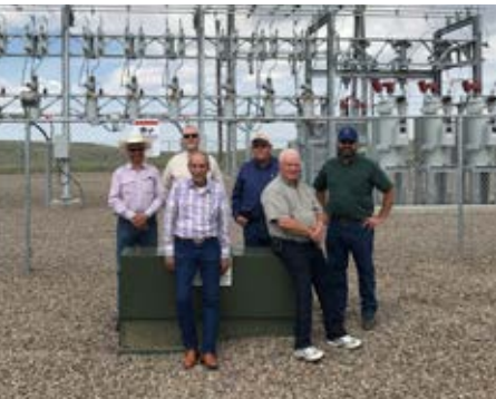
HCE Board members visit the Bonneau substation recently.

So what is the definition of cooperation? One definition of cooperation is, "the process of working together to the same end". I think this is an excellent way to describe how Hill County Electric (HCE) operates. HCE's Board and Management work together with our power suppliers to provide safe, reliable power at the lowest cost to you, the member. Our