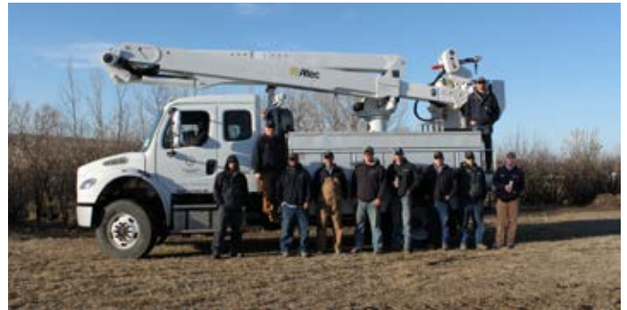
HCE's dedicated linemen.

As I wrap up my November message, I would like to wish our members a Happy Thanksgiving. We look forward to spending time with family and friends on Thanksgiving and we also honor our veterans on Veterans Day, Saturday, November 11th. Thank you to all veterans for your service and sacrifice.