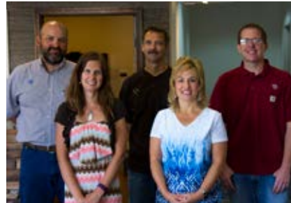
Our office team.

This is just another reason why electric cooperatives are so important. We are local and community centered. Just like your favorite locally-owned shop, restaurant or store, we all